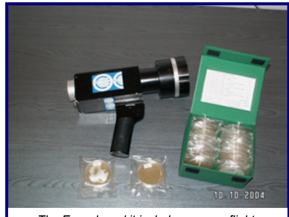
The Ecosphere kit includes a spaceflight-certified SAS air sampler and sets of Petri dishes containing nutrient-rich media