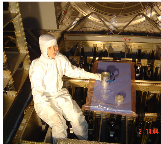
Air samples taken inside the ATV to characterize microbial airborne contamination