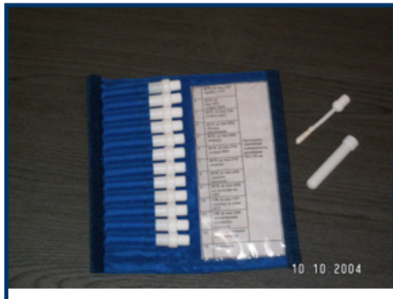
The Russian Surface pipette kit for sampling internal surfaces and structural materials

The highest bacterial concentration amounted to 1.1 \times 10^2 CFU/m 3 . A total of 66 isolates has been obtained and the bacteria were identified using molecular biology tools. The majority of the population consists of different Staphylococcus sp. (at least 60%) and Enterococcus faecalis (18%). Generally, the contamination levels reported by SCK•CEN are comparable with the observations made by IBMP and research groups of NASA.